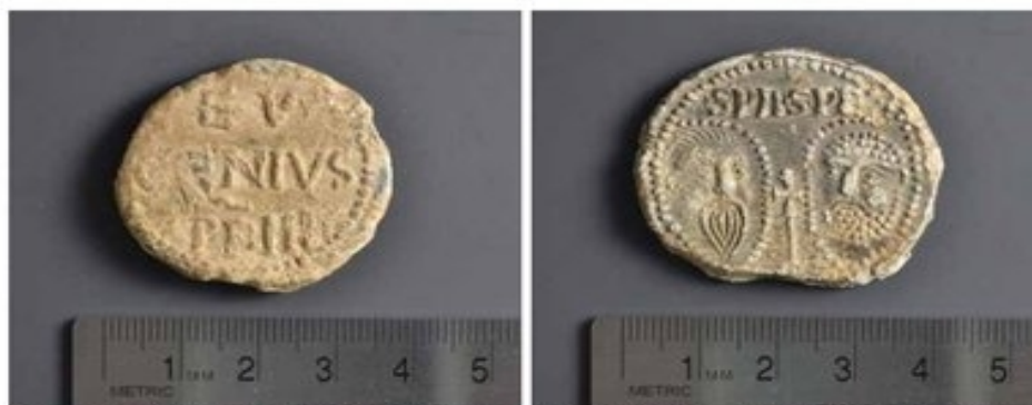
The seal, or bulla, of Paschal II once attached to Pie postulatio voluntatis has been lost. These photographs, courtesy of the University of Saint Mary of the Lake, Mundelein, IL, show the obverse and reverse of a bulla from Eugenius III (1145-1153). Eugene III's name is printed on the obverse. Images of Saints Peter and Paul are printed on the reverse.

All documents that come from the Pope have a metal seal called " Papal Bull ," (from Papa Bos or Pope Bull), that certifies a document is authentic, and High Priority documents have a golden seal called " Golden Bull :"