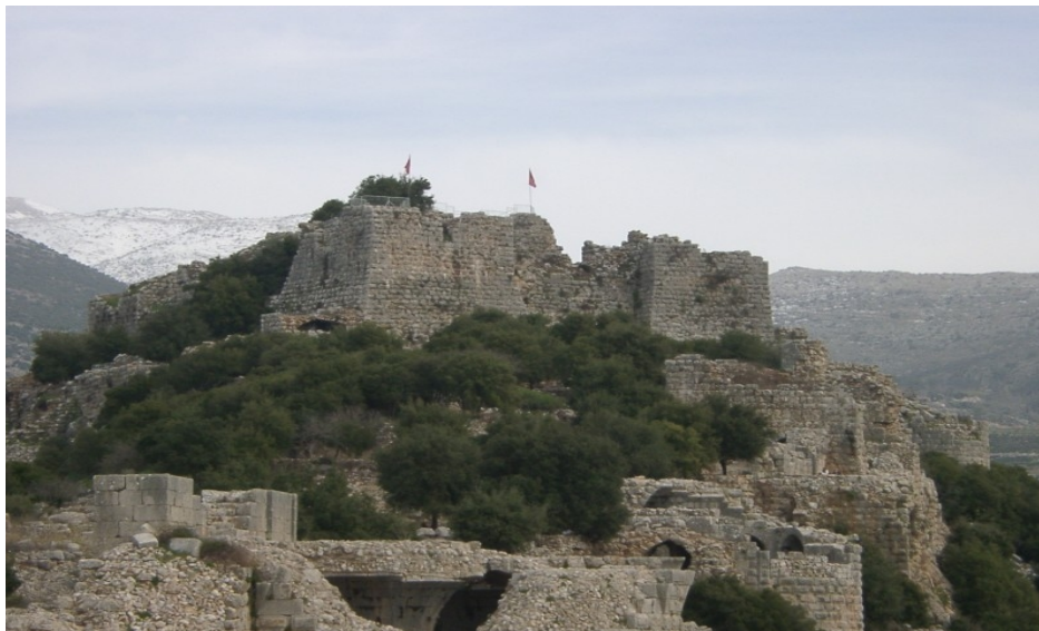
Nimrod's Fortress on Mount Hermon (Corruption Mountain)

As stated, Uraš (Ra), the Shining Sun, created offspring out of itself alone, i.e. Shu, Tefnut, and Hathor . Hathor is the “ Eye of Ra ,” and she is Ra's agent who is in charge of the Earth's Natural Resources. Hathor was the Queen of Tyre , ( Ezekiel 28:11-19 ), and was known by many names, like Ashtoreth, Astarte, Isis, Inanna, and Mary, who are called the “ Queen of Heaven .” Hathor was also known as the Pharaoh Hatshepsut and was called Hiram, which means the “Nobel.” As Ashtoreth, she was worshiped by Jacobs descendants, including King Solomon, ( Jeremiah 7:18, 44:17-25 ). She controlled the World Trade Markets and main shipping ports, i.e. the Port of Tyre and the Port of Sidon on the Mediterranean Sea, and the Port of Elim and the Port of Elat on the Red Sea, ( Ezekiel 27:1-36, Isaiah 23:15-18, 27:1, Numbers 33:9-10 ). The Nobel, Queen Ashtoreth, was the one who sold timber, gold, precious stones, etc. to King Solomon to build a Temple, ( 1 Kings 10:11-22 ), and she gave King Solomon the materials to rebuild the Castle on Mount Hermon where the fallen spirits came down, which is now known as King Nimrod's Fortress, ( 1 Kings 11:5, 2 Kings 23:13, Enoch 6:5-8 ):